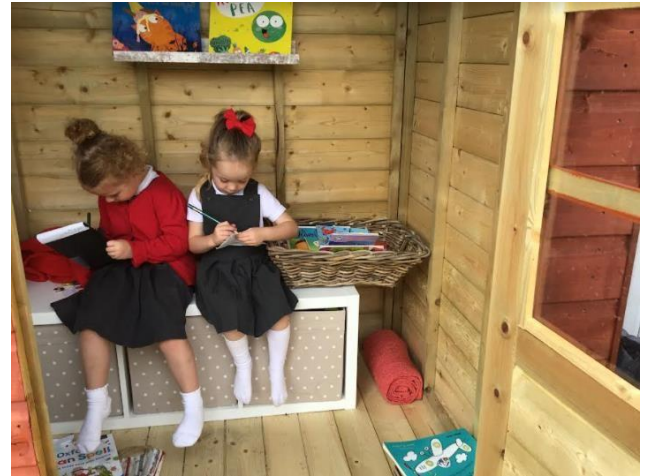
Reading and writing shed