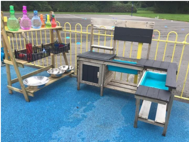
A sample of outdoor provision